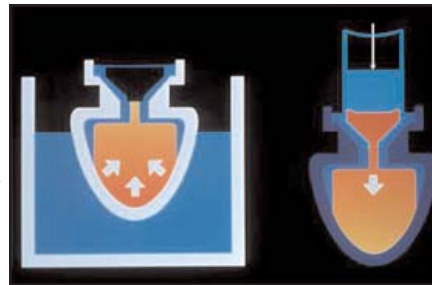
Traditional closed flask vs Ivocap continuous pressure

Typical “closed” flask processing restricts material flow and allows polymerization shrinkage.